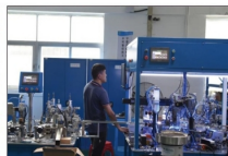
全自动成品组装机 FULLY AUTOMATIC FINISHED PRODUCT ASSEMBLY MACHINE