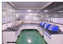
寿命实验室 LIFE LABORATORY