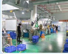
INJECTION MOLDING WORKSHOP 注塑车间