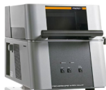
Fisher X-ray Coating Thickness Gauge 菲希尔 X射线镀层测厚仪