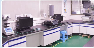
MEASURING ROOM 测量室