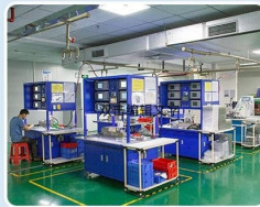
AUTOMATIC INSPECTION WORKSHOP 自动检测车间