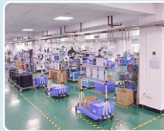
AUTOMATIC WORKSHOP 自动化车间