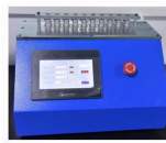
LIFE TESTER 寿命测试仪