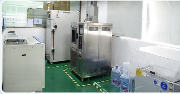
ENVIRONMENTAL LABORATORY 环境实验室