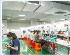
ASSEMBLY WORKSHOP 组装车间