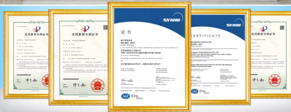
Patents and certificates