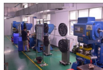
五金冲压 METAL STAMPING