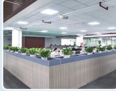
GENERAL OFFICE 综合办公室