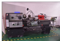
模具车床 MOLD MACHINE