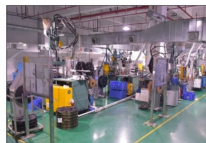
立式注塑机 VERTICAL INJECTION MOLDING MACHINE