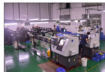
轴芯车床 LATHE AXIS CORE