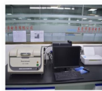
TIANRU RoHS TESTER 天瑞ROHS检测仪