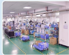
AUTOMATIC WORKSHOP 自动化车间