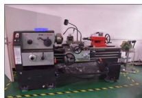
模具车床 MOLD MACHINE