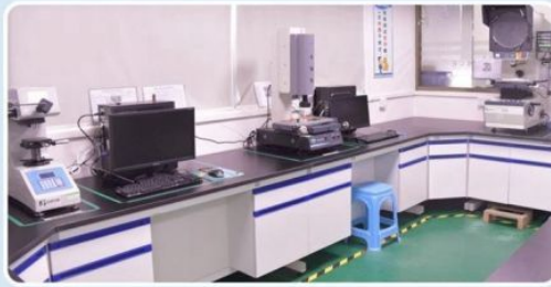
MEASURING ROOM 测量室