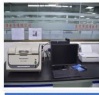
TIANRUI RoHS TESTER 天瑞ROHS检测仪