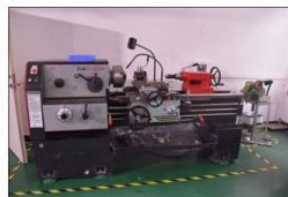
模具车床 COMPANY SHOWS