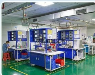
AUTOMATIC INSPECTION WORKSHOP 自动检测车间