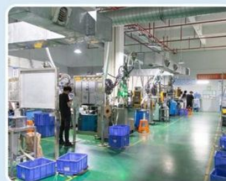
INJECTION MOLDING WORKSHOP 注塑车间