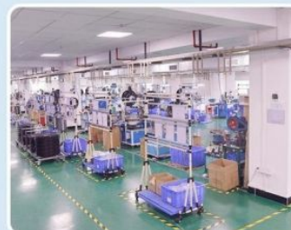
AUTOMATIC WORKSHOP 自动化车间