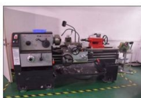
模具车床 COMPANY SHOWS