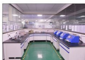
寿命实验室 LIFE LABORATORY