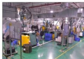
立式注塑机 VERTICAL INJECTION MOLDING MACHINE