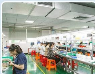
ASSEMBLY WORKSHOP 组装车间