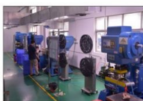
五金冲压 METAL STAMPING