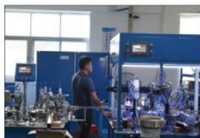
全自动成品组装机 FULLY AUTOMATIC FINISHED PRODUCT ASSEMBLY MACHINE