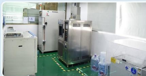
ENVIRONMENTAL LABORATORY 环境实验室