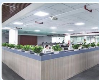
GENERAL OFFICE 综合办公室