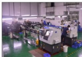
轴芯车床 LATHE AXIS CORE