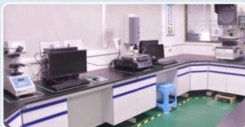
MEASURING ROOM 测量室