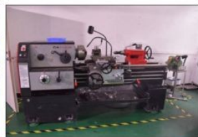
模具车床 COMPANY SHOWS