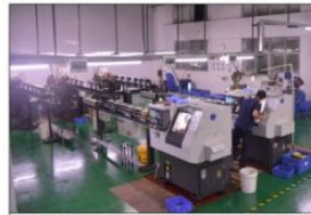
轴芯车床 LATHE AXIS CORE