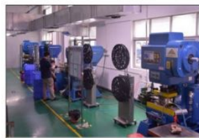
五金冲压 METAL STAMPING