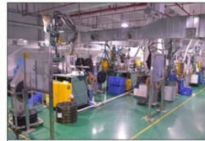
立式注塑机 VERTICAL INJECTION MOLDING MACHINE