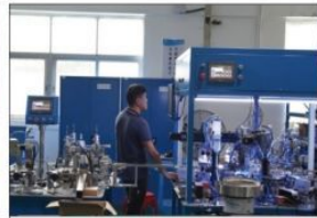
全自动成品组装机 FULLY AUTOMATIC FINISHED PRODUCT ASSEMBLY MACHINE