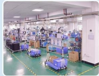
AUTOMATIC WORKSHOP 自动化车间