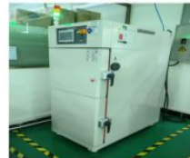
THERMAL SHOCK 冷热冲击