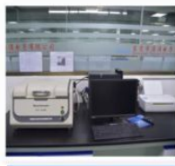
TIANRUI RoHS TESTER 天瑞ROHS检测仪