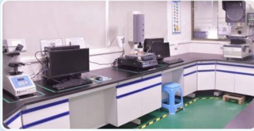
MEASURING ROOM 测量室