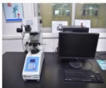
HARDNESS TESTER 硬度测试仪