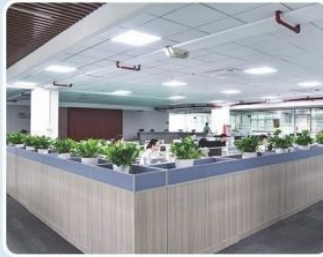
GENERAL OFFICE 综合办公室