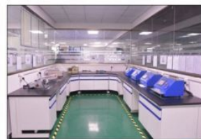
寿命实验室 LIFE LABORATORY