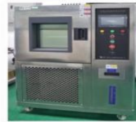
CONSTANT TEMPERATURE AND HUMIDITY MACHINE 恒温恒湿机