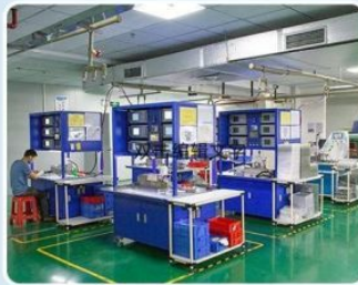
AUTOMATIC INSPECTION WORKSHOP 自动检测车间