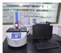
SWITCH LOAD TESTER 开关荷重测试仪