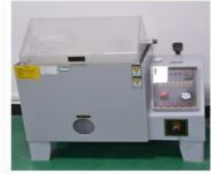
SALT SPRAY TESTER 盐雾测试仪