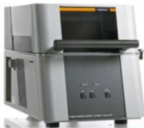
Fisher X-ray Coating Thickness Gauge 菲希尔 X射线镀层测厚仪