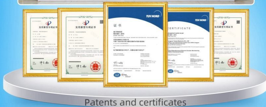
Patents and certificates