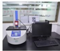
SWITCH LOAD TESTER 开关荷重测试仪