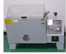
SALT SPRAY TESTER 盐雾测试仪