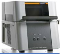
Fisher X-ray Coating Thickness Gauge 菲希尔 X射线镀层测厚仪