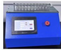
LIFE TESTER 寿命测试仪