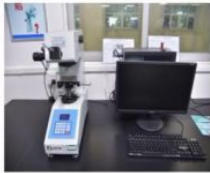
HARDNESS TESTER 硬度测试仪