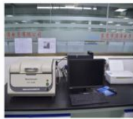
TIANRUI RoHS TESTER 天瑞ROHS检测仪