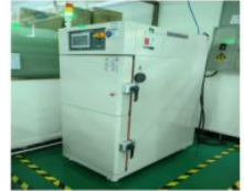
THERMAL SHOCK 冷热冲击