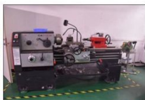
模具车床 COMPANY SHOWS