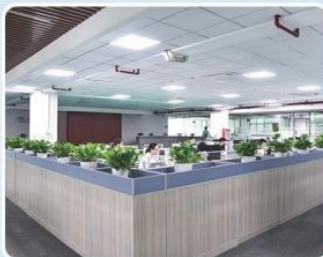
GENERAL OFFICE 综合办公室