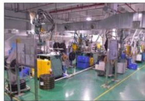
立式注塑机 VERTICAL INJECTION MOLDING MACHINE