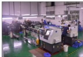
轴芯车床 LATHE AXIS CORE