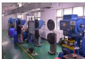
五金冲压 METAL STAMPING