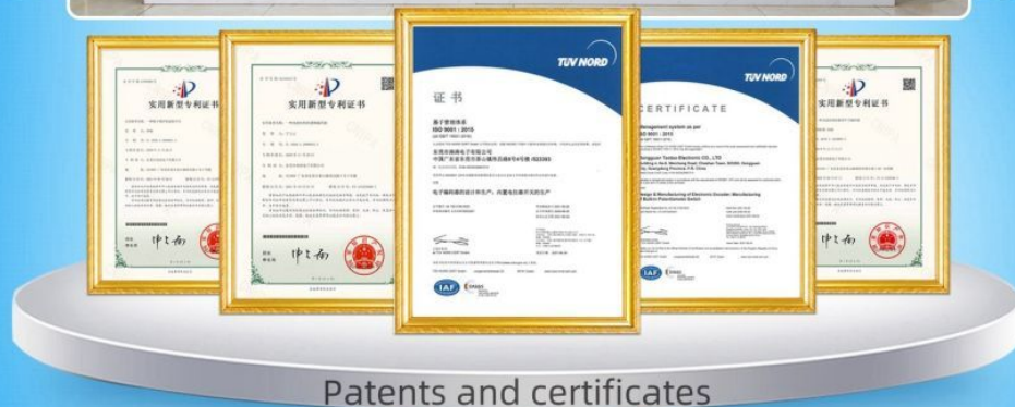
Patents and certificates