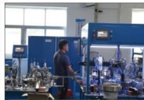
全自动成品组装机 FULLY AUTOMATIC FINISHED PRODUCT ASSEMBLY MACHINE