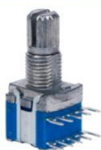
Rotational life: 10000cycles