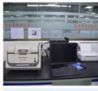
TIANRUI RoHS TESTER 天瑞ROHS检测仪