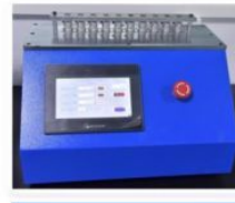
LIFE TESTER 寿命测试仪