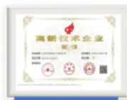
HIGH TECH ENTERPRISES 高新技术企业