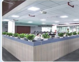
GENERAL OFFICE 综合办公室