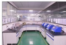
寿命实验室 LIFE LABORATORY