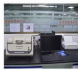
TIANRUI RoHS TESTER 天瑞ROHS检测仪