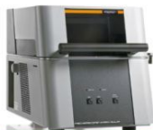
Fisher X-ray Coating Thickness Gauge 菲希尔 X射线镀层测厚仪