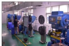
五金冲压 METAL STAMPING