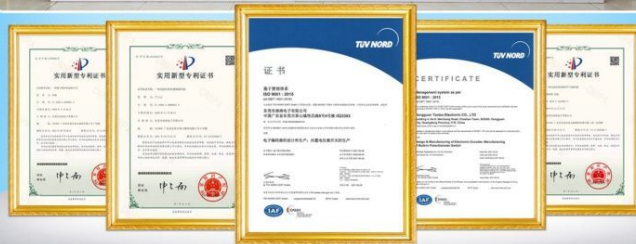
Patents and certificates