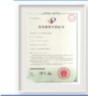
TYPE 11 ENCODER AUTOMATIC ASSEMBLY MACHINE 11型编码器自动组装机