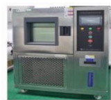
CONSTANT TEMPERATURE AND HUMIDITY MACHINE 恒温恒湿机