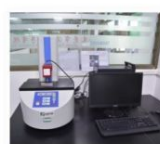
SWITCH LOAD TESTER 开关负重测试仪