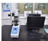
HARDNESS TESTER 硬度测试仪