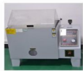
SALT SPRAY TESTER 盐雾测试仪