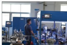
全自动成品组装机 FULLY AUTOMATIC FINISHED PRODUCT ASSEMBLY MACHINE