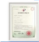
NORMALIZED STRAIGHT SLIDE POTENTIOMETER 归中直滑电位器