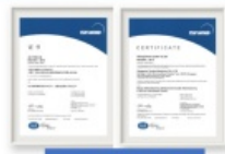
ISO9001:2015 EDITION ISO9001:2015版