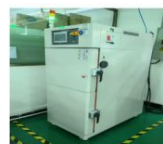
THERMAL SHOCK 冷热冲击