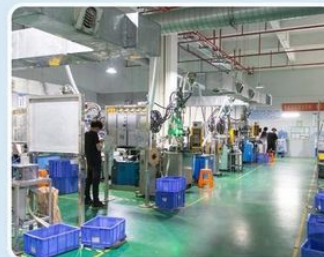
INJECTION MOLDING WORKSHOP 注塑车间