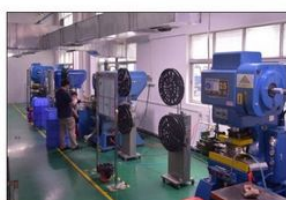
五金冲压 METAL STAMPING