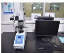
HARDNESS TESTER 硬度测试仪