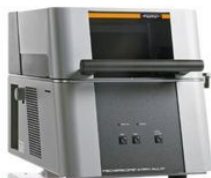
Fisher X-ray Coating Thickness Gauge 菲希尔 X射线镀层测厚仪