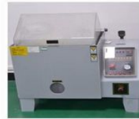
SALT SPRAY TESTER 盐雾测试仪