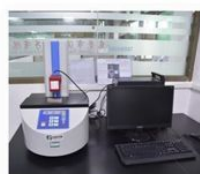
SWITCH LOAD TESTER 开关荷重测试仪