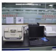
TIANRUI RoHS TESTER 天瑞ROHS检测仪