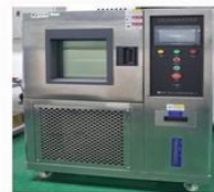
CONSTANT TEMPERATURE AND HUMIDITY MACHINE 恒温恒湿机