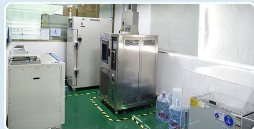
ENVIRONMENTAL LABORATORY 环境实验室