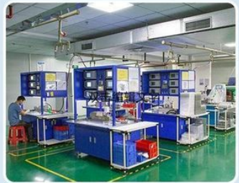
AUTOMATIC INSPECTION WORKSHOP 自动检测车间