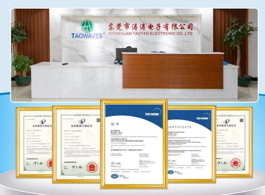
Patents and certificates