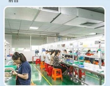
ASSEMBLY WORKSHOP 组装车间