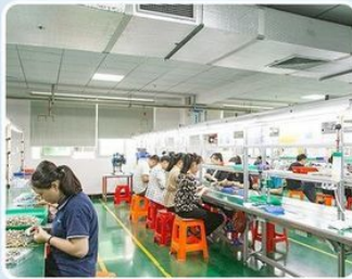
ASSEMBLY WORKSHOP 组装车间