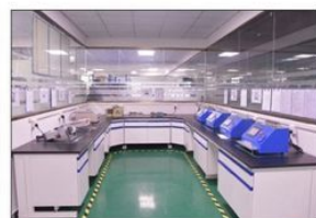
寿命实验室 LIFE LABORATORY