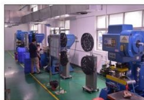
五金冲压 METAL STAMPING