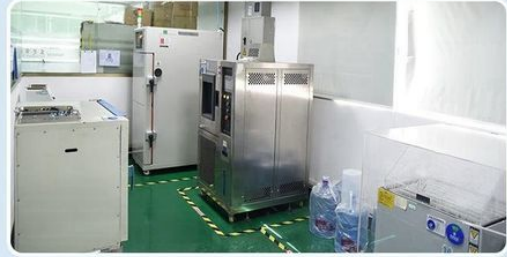
ENVIRONMENTAL LABORATORY 环境实验室