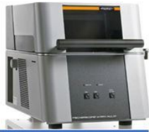
Fisher X-ray Coating Thickness Gauge 菲希尔 X射线镀层测厚仪