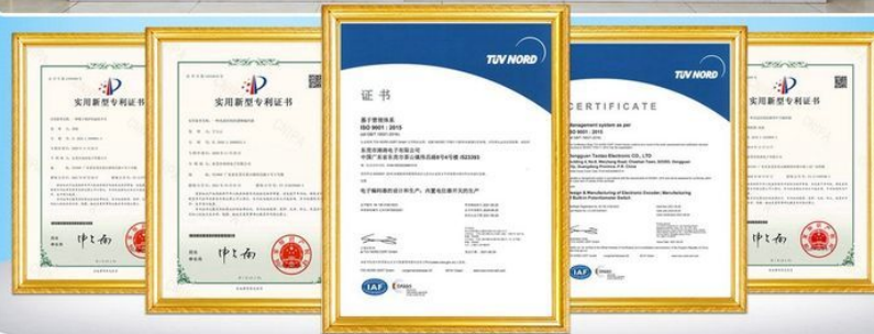
Patents and certificates