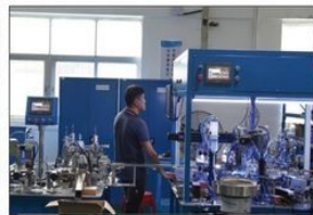
全自动成品组装机 FULLY AUTOMATIC FINISHED PRODUCT ASSEMBLY MACHINE