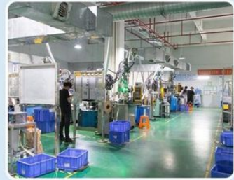
INJECTION MOLDING WORKSHOP 注塑车间