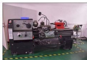
模具车床 COMPANY SHOWS