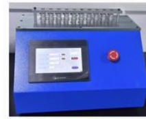
LIFE TESTER 寿命测试仪