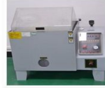
SALT SPRAY TESTER 盐雾测试仪