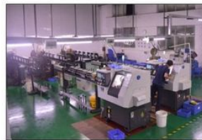
轴芯车床 LATHE AXIS CORE