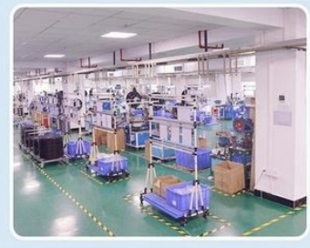
AUTOMATIC WORKSHOP 自动化车间