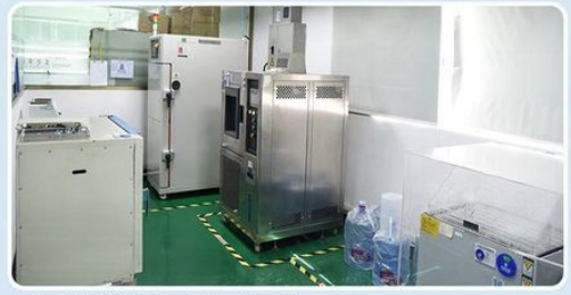
ENVIRONMENTAL LABORATORY 环境实验室