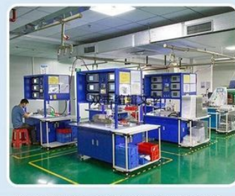
AUTOMATIC INSPECTION WORKSHOP 自动检测车间