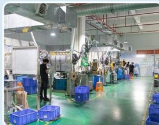
INJECTION MOLDING WORKSHOP 注塑车间