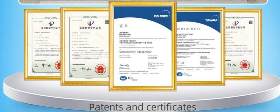
Patents and certificates