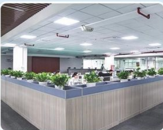
GENERAL OFFICE 综合办公室