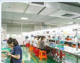
ASSEMBLY WORKSHOP 组装车间