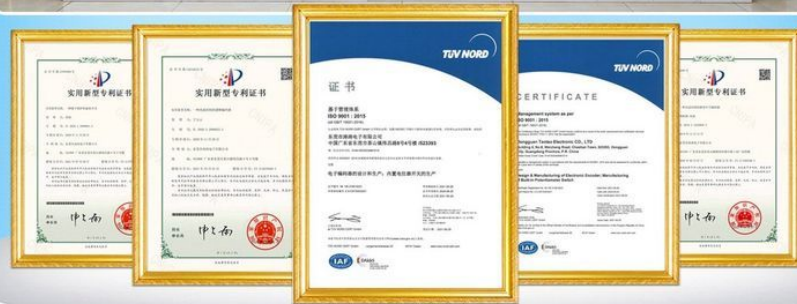
Patents and certificates