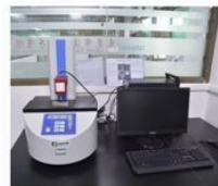
SWITCH LOAD TESTER 开关荷重测试仪