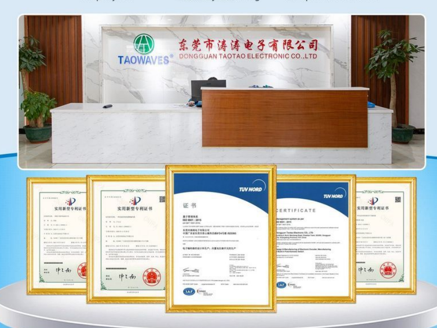
Patents and certificates