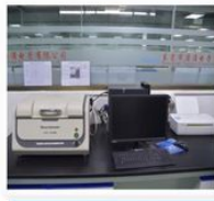
TIANRUI RoHS TESTER 天瑞ROHS检测仪