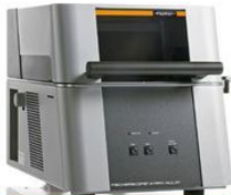
Fisher X-ray Coating Thickness Gauge 菲希尔 X射线镀层测厚仪