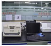
TIANRUI RoHS TESTER 天瑞ROHS检测仪