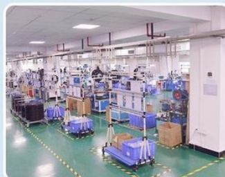
AUTOMATIC WORKSHOP 自动化车间