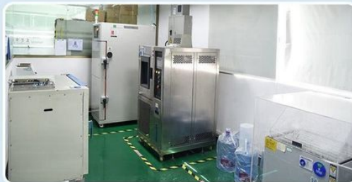
ENVIRONMENTAL LABORATORY 环境实验室