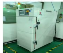
THERMAL SHOCK 冷热冲击