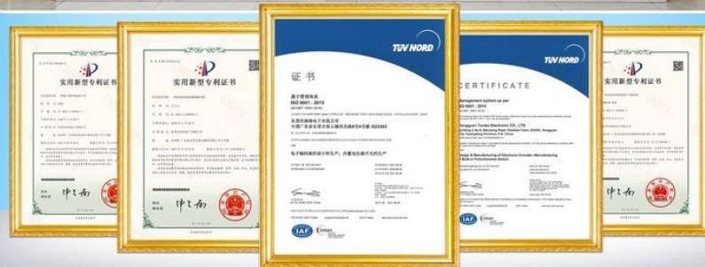
Patents and certificates